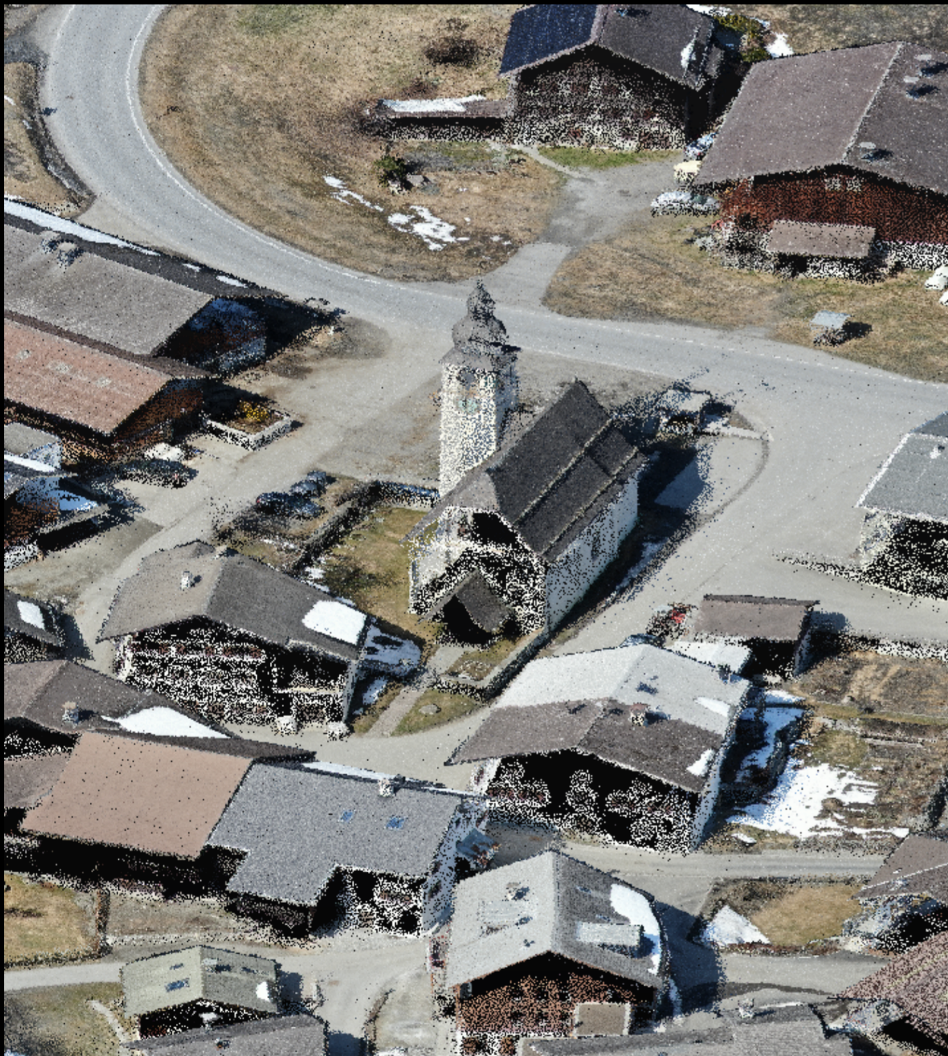
Point-cloud-generated context model of Urmein, GR.