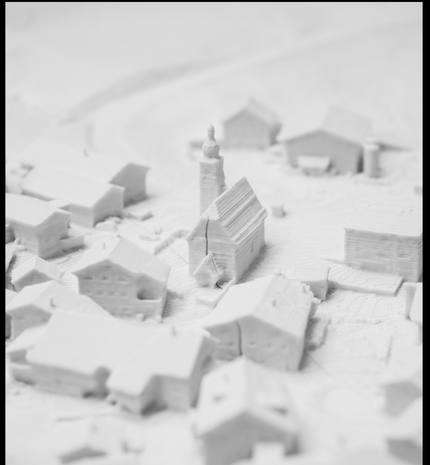
3D-printed site-model in architectural scale.